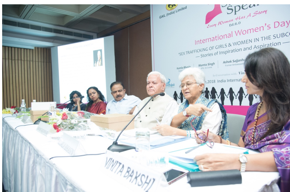
SheSpeaks Edition 6: Sex Trafficking of girls and women in the Subcontinent