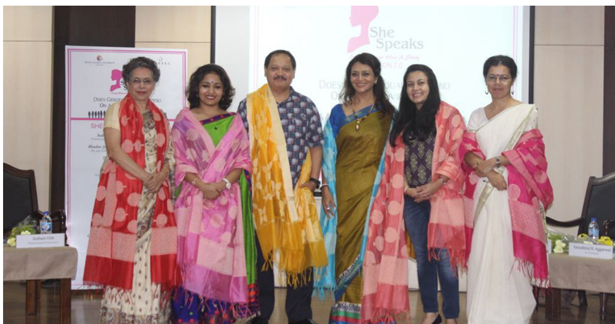
SheSpeaks Edition 7: Does Gender Equality depend on area and environment

Area the physical boundary the concrete reality of the space in which we dwell and environment which is more of metaphysical reality is our eco system. The factors, the influences, intangible aspects that play on physical or concrete reality of a human entity.