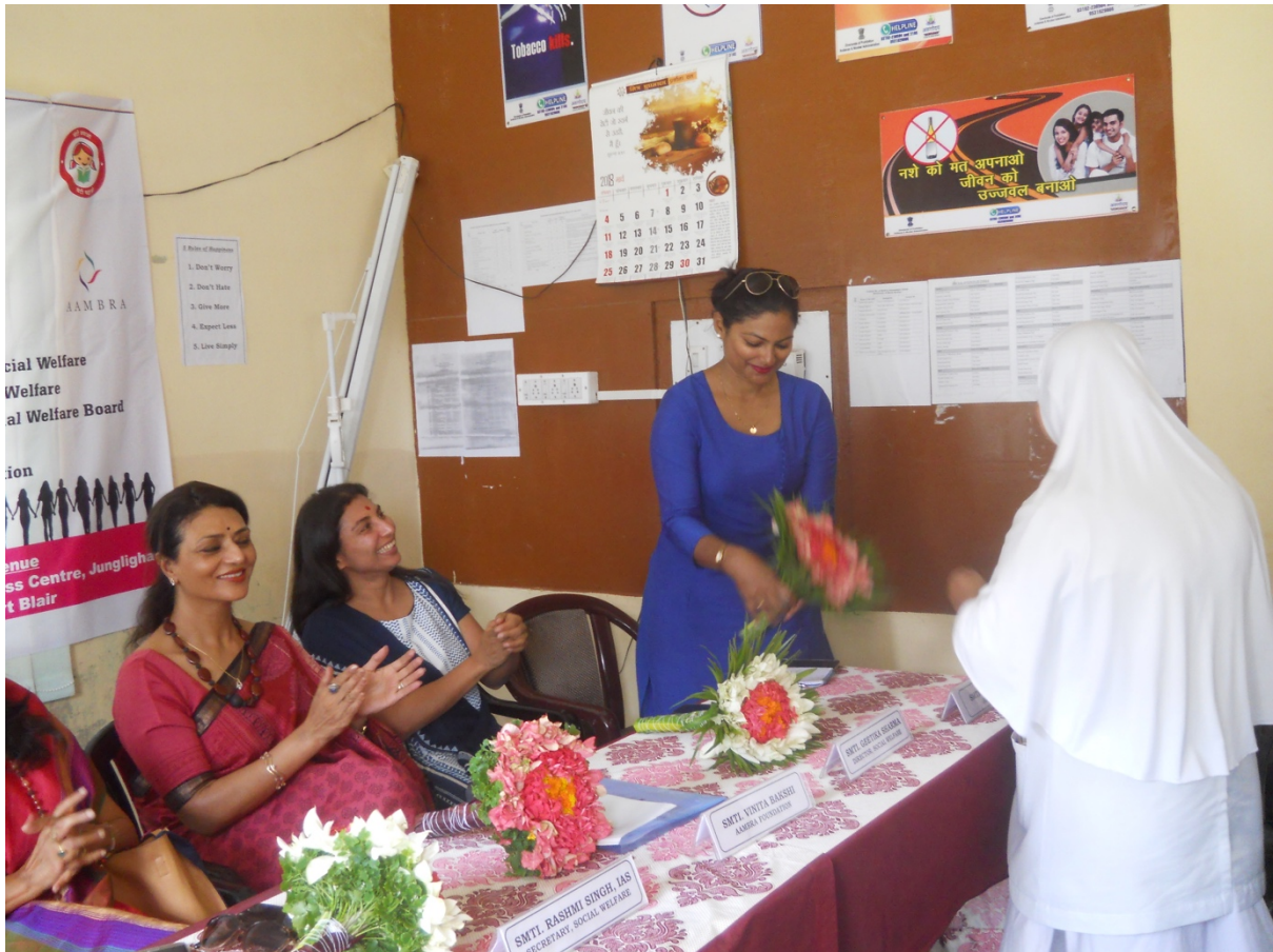
SheSpeaks Edition 4.1 : Harassment of women in the workplace Location – Andaman & Nicobar Islands