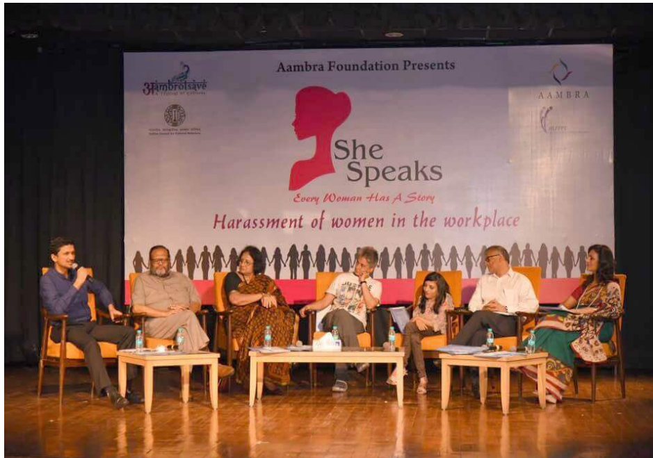
SheSpeaks Edition 4: Harassment of women in the workplace

The mark of civilisation is when everyone lives in a meritocracy, in physical and emotional safety. An ideal situation it might be! but for thousands of years it has been a work in progress.