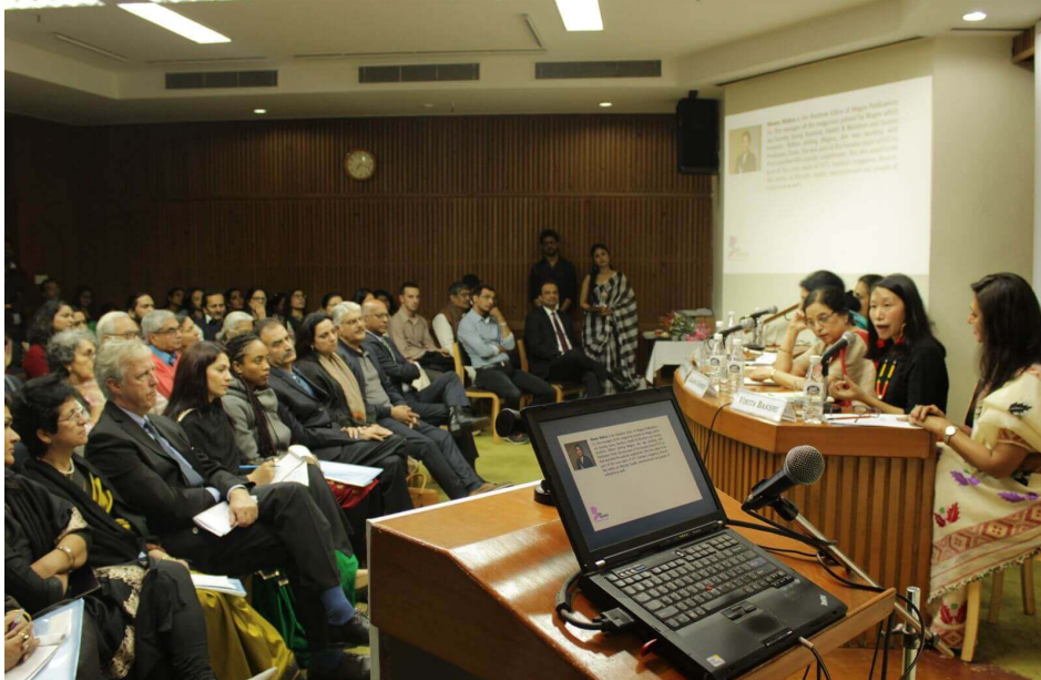
SheSpeaks Edition 5: Tagging and typecasting women