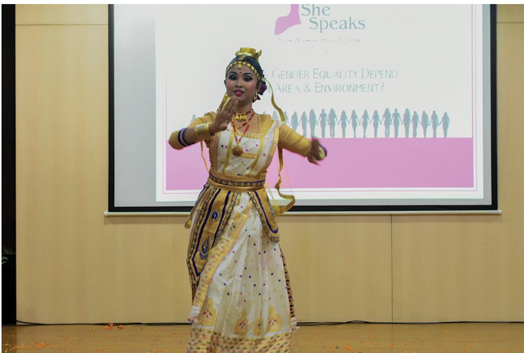
Glimpses of Sattriya Dance – a dance drama depicting the divine acts of Lord Krishna.